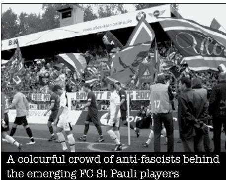
A colourful crowd of anti-fascists behind the emerging FC St Pauli players

Real Hereford fans often put forward ideas for improving the attendance at United games. Surely stamping out this kind of behaviour would go some way towards that. Who would want to bring their children to a game if they had to put up with idiots like these? Luckily some Hereford fans have been able to point these racists out so their faces are now known. But there needs to be a concerted effort to