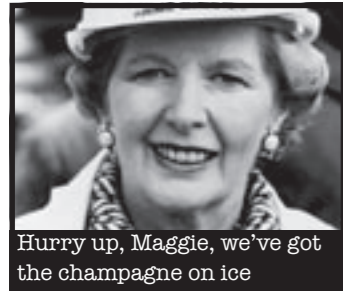
Hurry up, Maggie, we've got the champagne on ice

■ What's all this about Margaret Thatcher getting a £3 million state funeral? Why bother, no one's going to be mourning her death anyway. Just push her body in the fire and scatter the ashes in pub urinals the length and breadth of Britain.