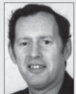
Roger Phillips UTF FTW TWWaT

If you run an essential public service, we can help to shut it down No job too big — Schools and swimming pools a speciality! Don't delay, call today! 07792 880019