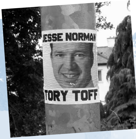
SPOTTED – Hereford’s MP stuck to a lamppost

FREEDOM, EQUALITY, COMMUNITY • #15 • AUGUST/SEPTEMBER 2010