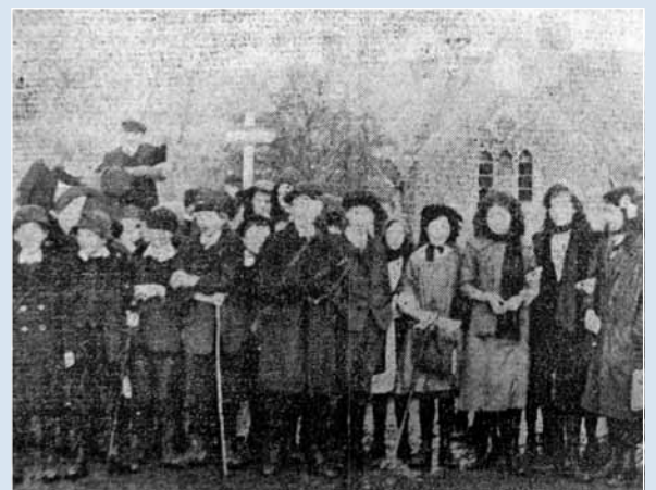
Top: Pupils at Ledbury Girls' School surround their new headmistress to stop her getting in to the school.