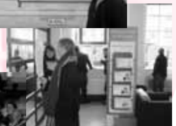
Protesters occupy Lloyds TSB