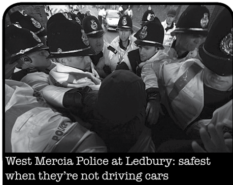
West Mercia Police at Ledbury: safest when they're not driving cars