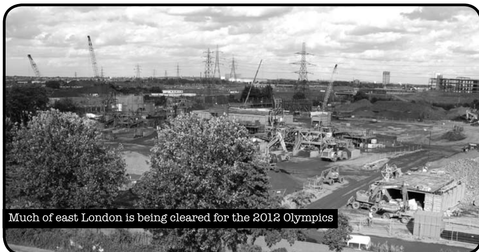
Much of east London is being cleared for the 2012 Olympics