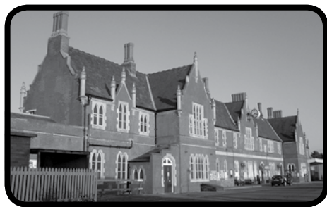
Herded in and herded out for £££: A condenser for the new cattle market?

Major rail companies announced further price rises in January, this time by an average of 6%. These rises are nicely timed at the start of a recession, when most other services are cutting prices to attract customers. This should come as no surprise though; rail companies have had a history of greed and misconduct.