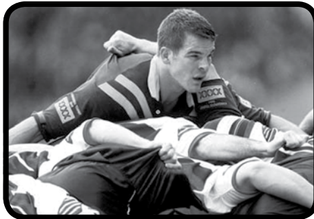
Australian Rugby League star Ian Roberts

But the media is not always that supportive. The negative comments aimed towards female tennis as being a 'gay sport' is an example of this.