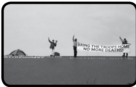
Campaigners on the office roof of Raytheon in Bristol. They stayed up there for a month

† See www.indymedia.org.uk/en/2009/01/419762