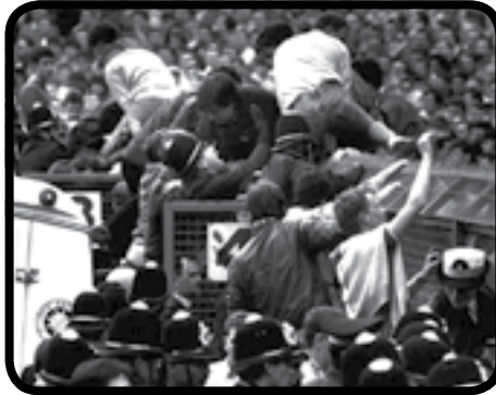
Fans try to escape the crush behind the crowd barriers. Ninety-six people died.