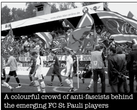
A colourful crowd of anti-fascists behind the emerging FC St Pauli players

Real Hereford fans often put forward ideas for improving the attendance at United games. Surely stamping out this kind of behaviour would go some way towards that. Who would want to bring their children to a game if they had to put up with idiots like these? Luckily some Hereford fans have been able to point these racists out so their faces are now known. But there needs to be a concerted effort to