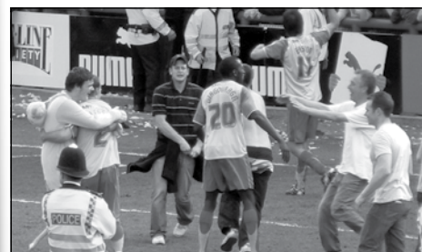
United fans congratulate the team after securing promotion at Brentford

Racism —The clubs football on the pitch may be developing, but the vocabulary of a small minority of fans is not. Racist chants and racially orientated abuse aimed at people on and off the pitch were heard at numerous games during the season, something which can not be tolerated. This has been, is being and will continue to be dealt with. Let's kick racism off the terraces!