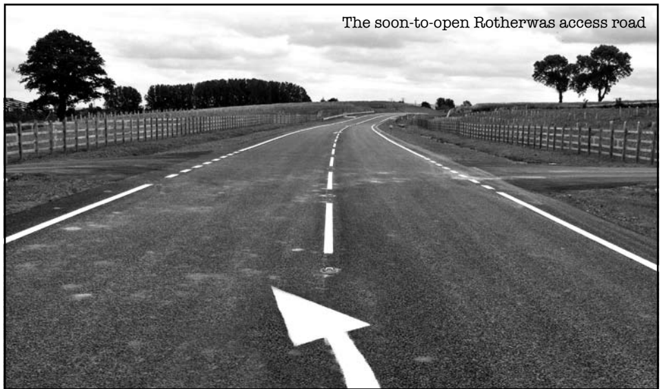
The soon-to-open Rotherwas access road

Is there anyone left on the council that does