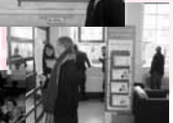
Protesters occupy Lloyds TSB