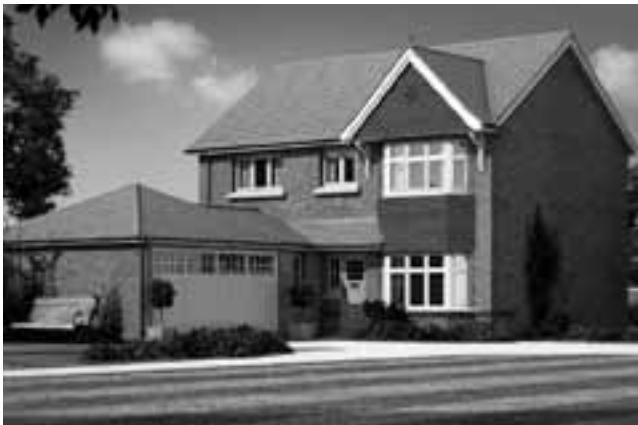
Nice house... if you can afford it

In a recent full page advert in the Hereford Times, the 'Local Conservatives' made a commitment to building more houses. Which should be a good thing—thousands of Herefordians are in need of a decent house and there is currently a shortage of affordable